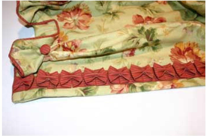
Instead of ribbon, you can use your own fabric to make the bow-tie trim. Just make a 1-1/2" tube of fabric and turn right side out and press. Follow the steps above.