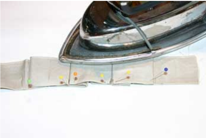
Press the pleats in place.

Using the marks, pleat up the ribbon forming 2" box pleats as shown above.