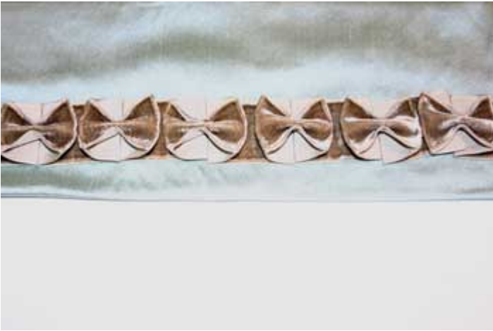
Keep pleating and tacking and you will have a beautiful handmade trim for your curtain!